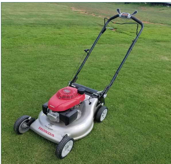
FIGURE 3. Proper mower maintenance is critical to maintaining healthy, viable turfgrass. Take time to keep mower blades cleaned and properly sharpened.

It is important to properly maintain any equipment that is being used to manage a turfgrass area. Dull mower blades will not cut grass properly and may cause injury by crushing, shredding, or leaving jagged, uneven cuts on turfgrass leaf blades. These injuries will increase turfgrass susceptibility to pests including diseases and insects and will ultimately compromise turfgrass response to other environmental stresses such as drought or heat. Most mower blades can be sharpened at home or professionally. Use caution when sharpening mower blades to avoid the risk of injury. Always turn off mowers and remove the spark plug prior to maintenance.