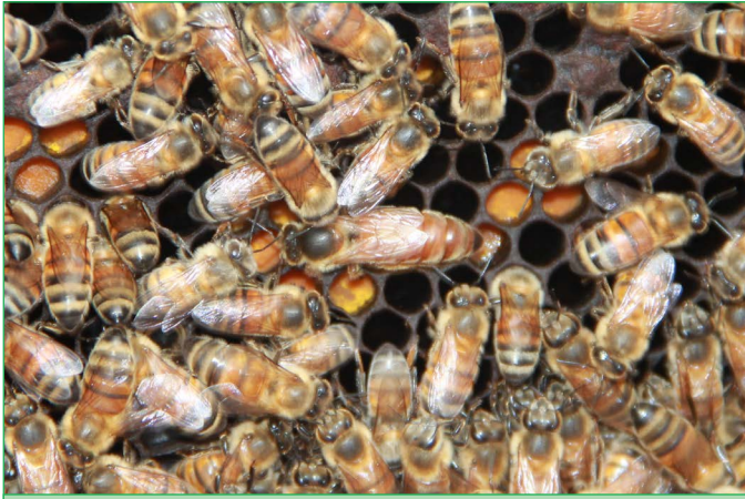
Queen bee (center) among her workers. Bees are likely to sting only when they perceive a threat to the nest or the queen.

Foraging bees. A foraging bee is a worker that flies away from the nest to collect nectar, pollen, or water. Foragers have nothing to defend and are not likely to sting unless provoked. Bees visiting flowers and other food sources should not be disturbed.