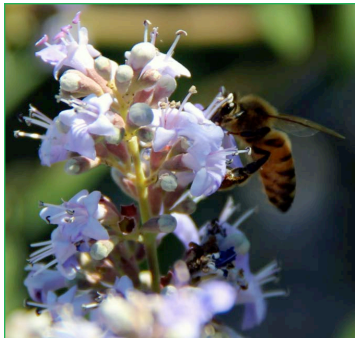
Honey bees are valuable pollinators and rarely sting when they are away from the nest searching for nectar.

Swarming bees. Honey bees may leave a nest site for a variety of reasons. Sometimes entire colonies leave a nest (abscond) because of overcrowding, heat, pest infestation, insufficient food or water in the area, or some other disturbance. Colonies may also split (swarm) as a mode of reproduction. In these cases, about one fourth of the old colony remains in the nest, while the rest of the adult bees and the old queen go on to establish a new nest. Swarming usually occurs in the spring or summer for