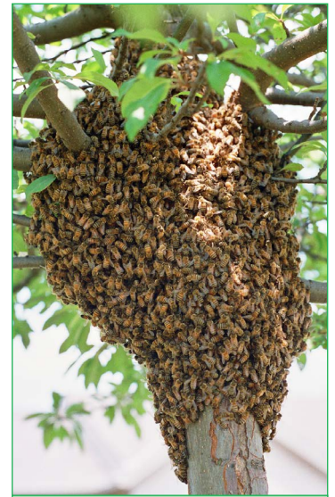
A honey bee swarm.

Collecting a swarm or managing a honey bee colony in a building should be left to professional pest control companies. They have the skill and equipment to do a