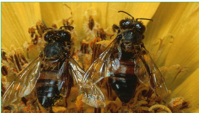
An Africanized honey bee (left) and a European honey bee (right). Despite size differences in these two individuals, the two strains cannot be distinguished visually.

To improve honey production, an African race of honey bees was introduced by bee breeders in Brazil in the mid 1950's. This race was known to be very good at producing honey but was also known for its aggressive behavior. In 1957 some of these Africanized bees escaped from the breeding program and spread throughout South and Central America. Africanized bees entered South Texas in 1990.