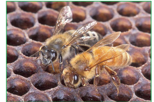
An Africanized honey bee (left) and a European honey bee (right) on a honey comb. Despite the color differences in these two individuals, the two strains cannot be distinguished visually.

Since then, Africanized honey bees have interbred with wild European honey bees and have spread throughout Texas. As of 2006, when formal testing programs were halted, Africanized honey bees had been detected in 163 of Texas' 254 counties. Today it is assumed that most feral bee colonies in Texas carry some genes of African descent and therefore may be aggressive.