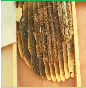
Honey bees can construct large wax nests rapidly once they enter a home. For this reason, honey bees and nests should be removed as soon as possible.

A honey bee colony consists mostly of worker bees. Workers are infertile females, but can lay unfertilized eggs if the queen is absent or declining. Workers perform many functions based on age. When they first emerge from their cells as adults, worker bees act as house cleaners. As they age, they progress through roles of nurses, construction workers, guards, and eventually foragers. Worker bees gather food and pro-