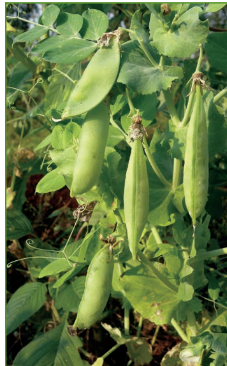
Figure 1. Most cultivars are climbing vines and need a trellis for support.